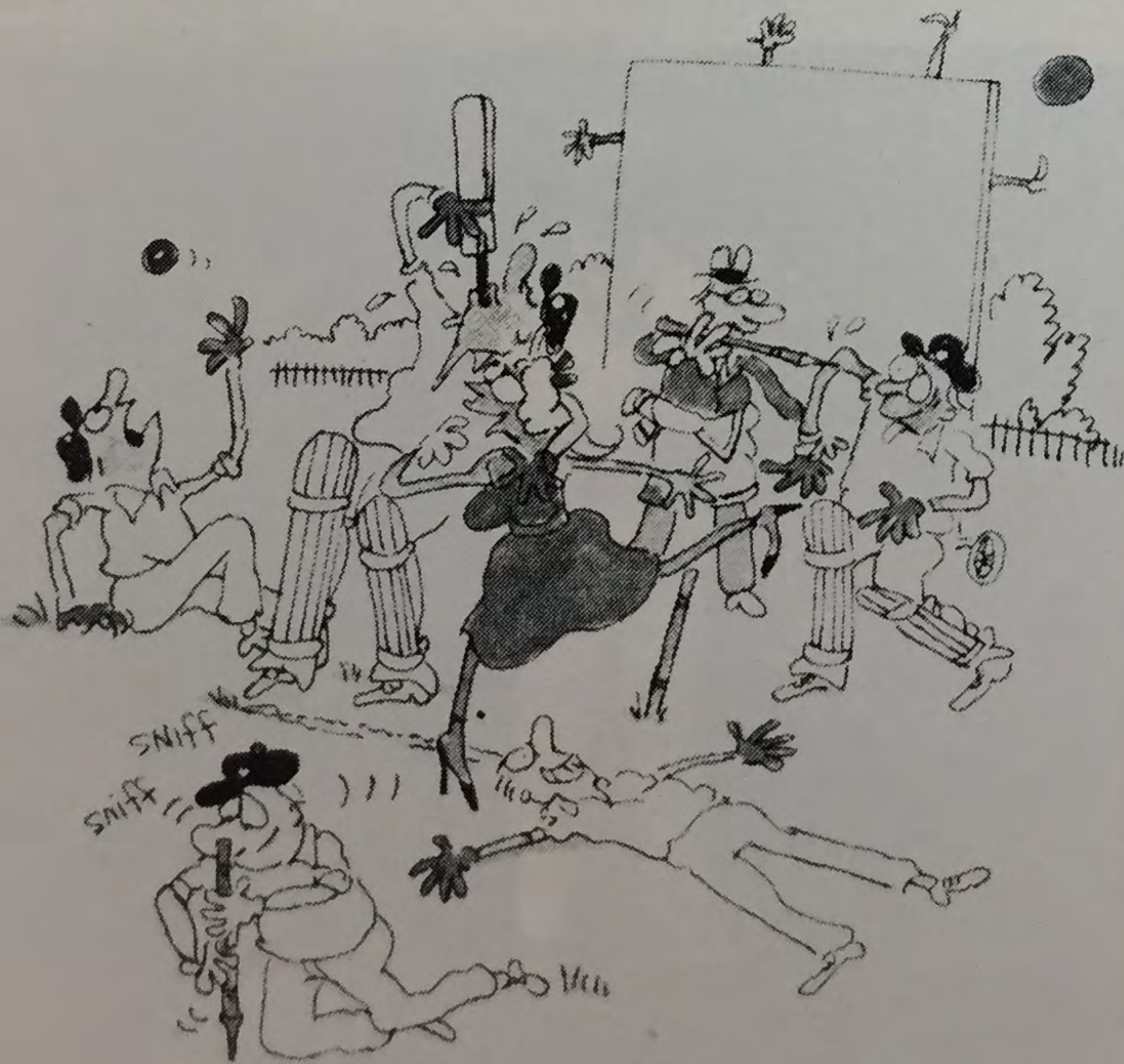
Settle down 'Cross