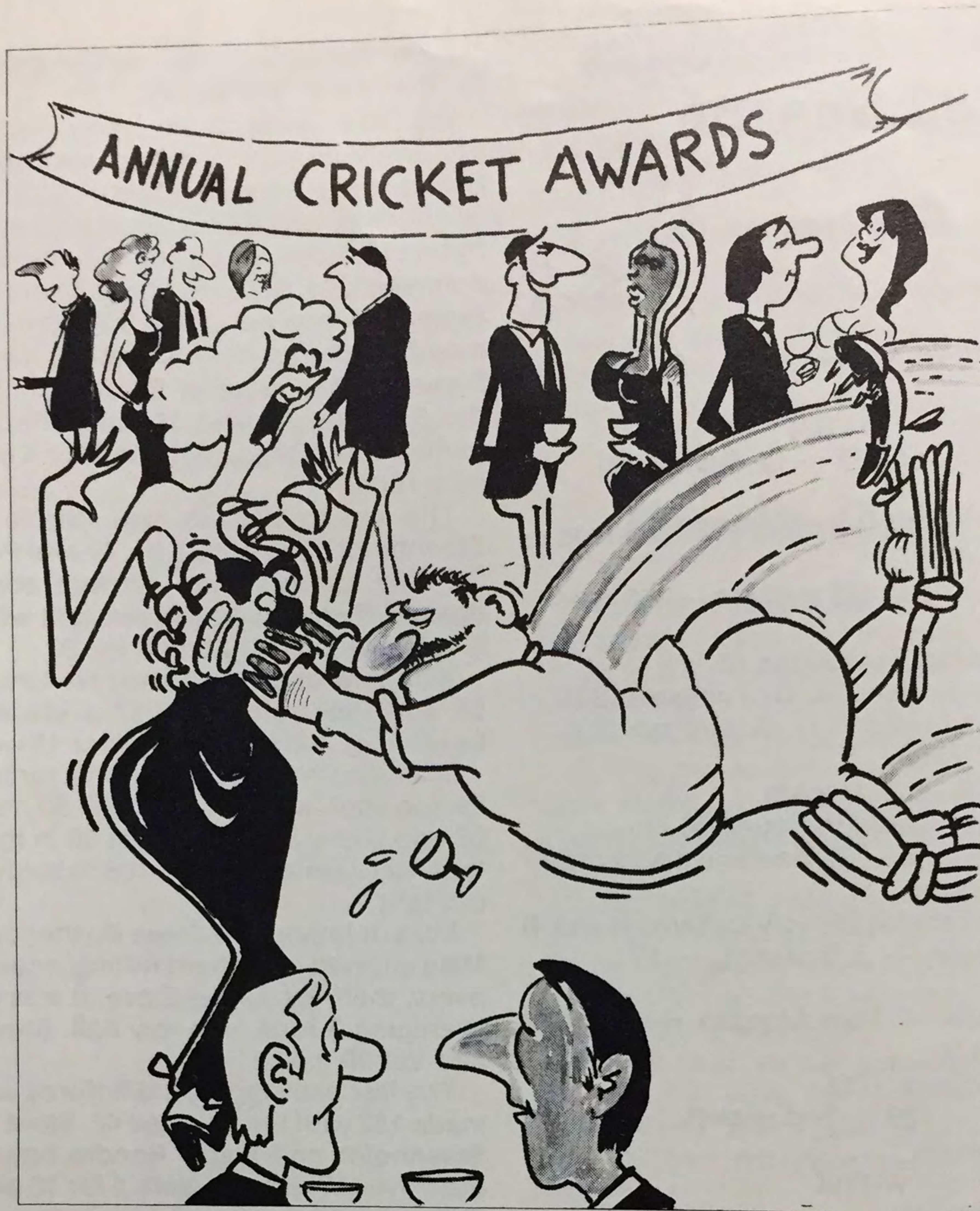
"Natural reflex, I'm afraid. Anything moves — he catches it."